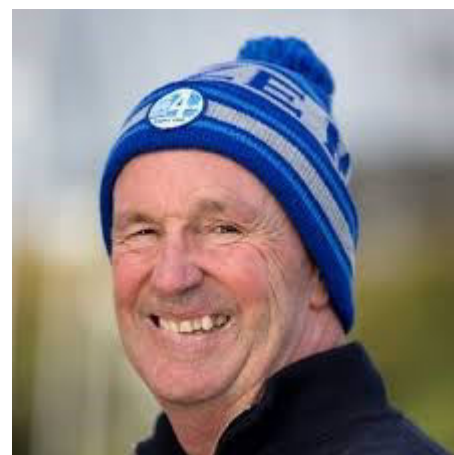
The face of FIGHT MND AFL Legend Neale Daniher

We are pleased to advised $250 will be forwarded from PFC