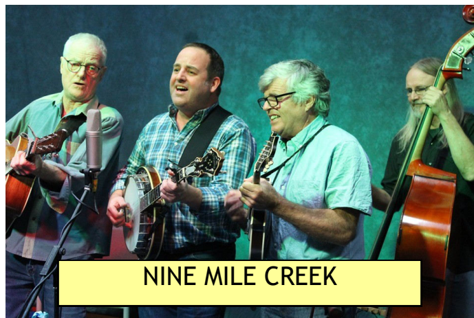
NINE MILE CREEK