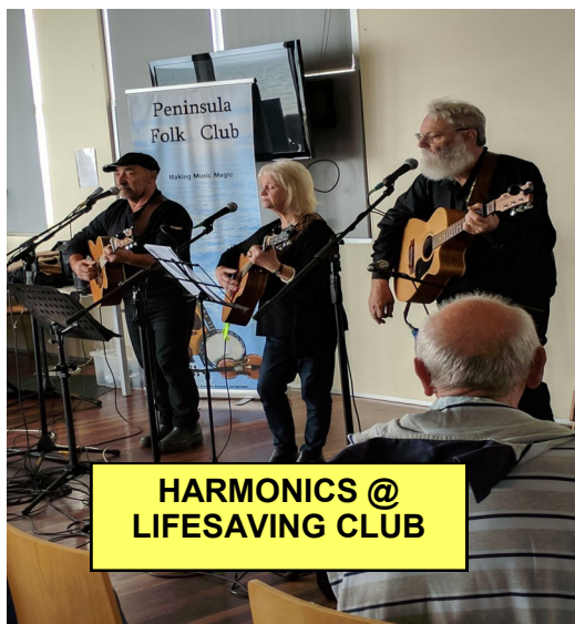
HARMONICS @ LIFESAVING CLUB