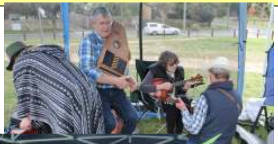
TUNE UP !!