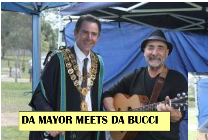
DA MAYOR MEETS DA BUCCI