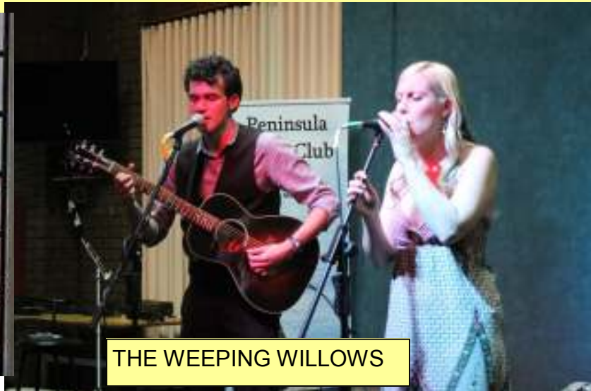
THE WEEPING WILLOWS