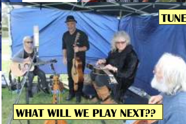
WHAT WILL WE PLAY NEXT??