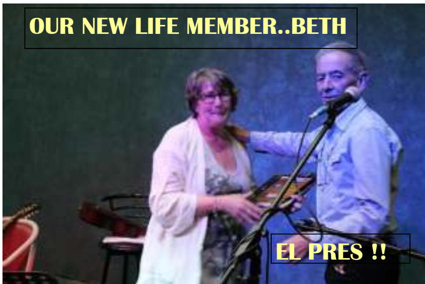
EL PRES !!