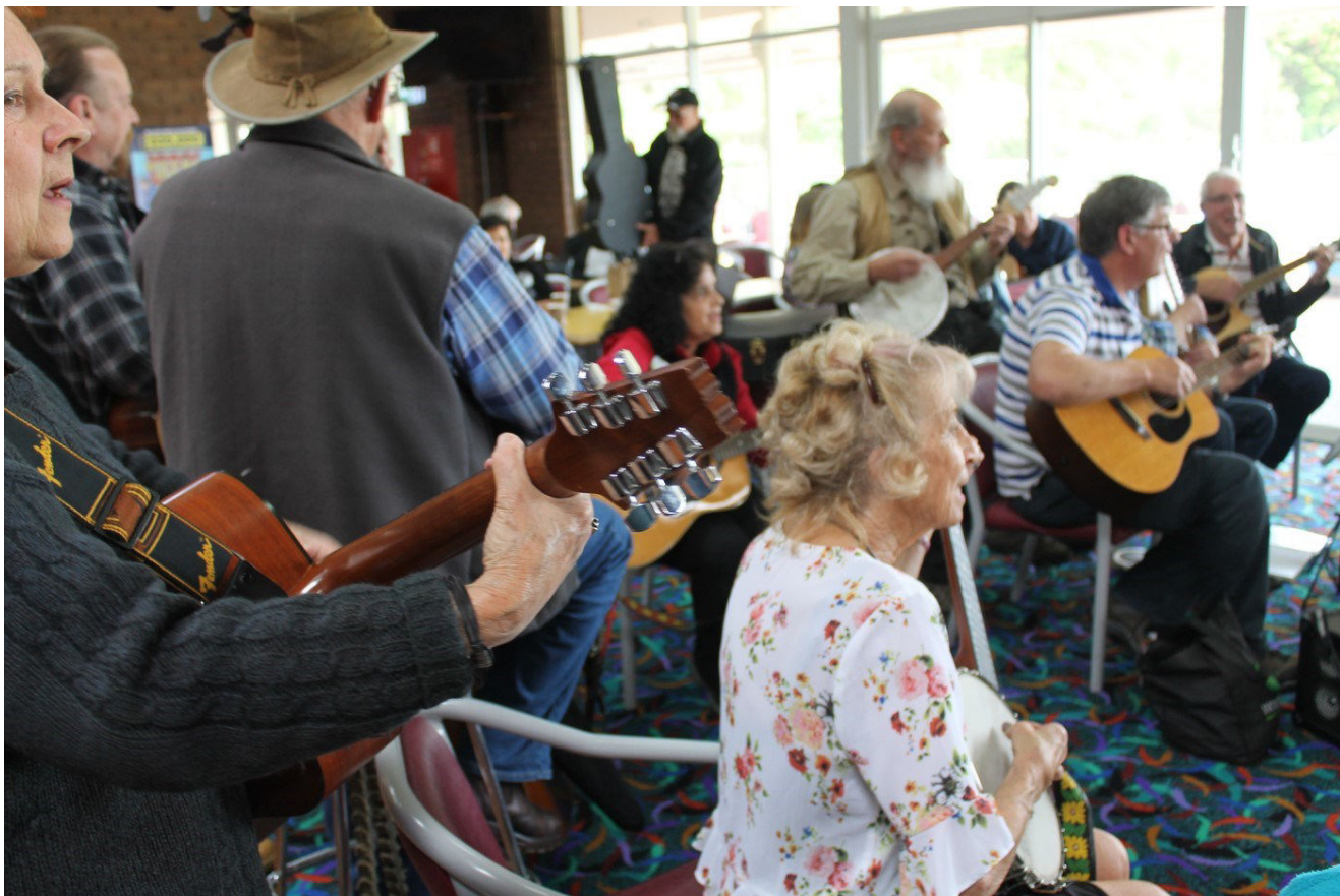
A COUPLA SNAPS FROM OUR DECEMBER CHRISTMAS PARTY