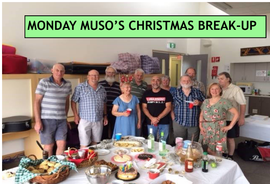
MONDAY MUSO'S CHRISTMAS BREAK-UP

@ Hastings Community Centre 185 High St Hastings from 1.30 - 3.30 pm each MONDAY. This is a great comfortable venue that the Hastings Community Centre is happy to make available. $5.00 do- nation, This is an ideal venue for beginners.. It is "in the round" with folk taking turns to introduce songs (or let their turn pass if not comfortable to lead)